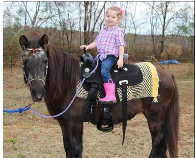
PEPPER & HER NEW CHILDREN