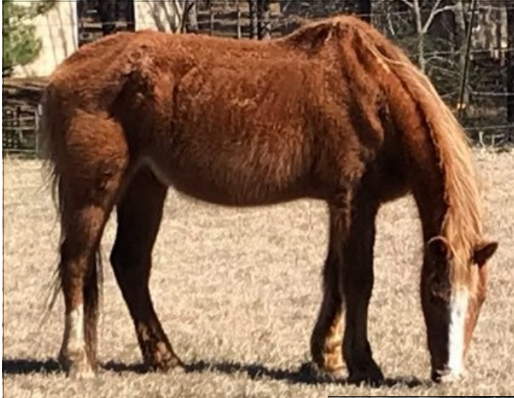
LITTLE BUCKY, below