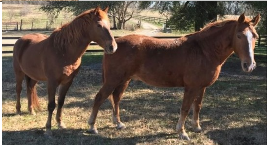
PEANUT AND RAIN, right